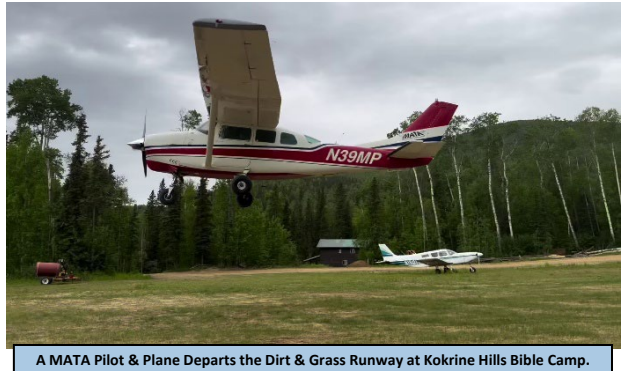
A MATA Pilot & Plane Departs the Dirt & Grass Runway at Kokrine Hills Bible Camp.