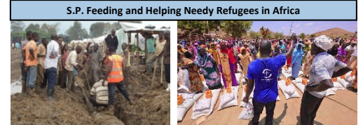
S.P. Feeding and Helping Needy Refugees in Africa