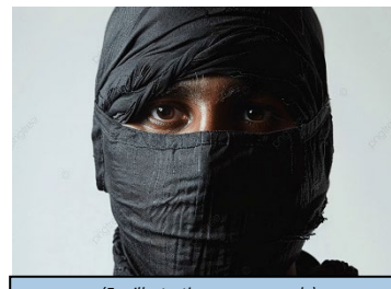
(For illustration purposes only)

https://www.youtube.com/watch?v=51OfdmMH6W8