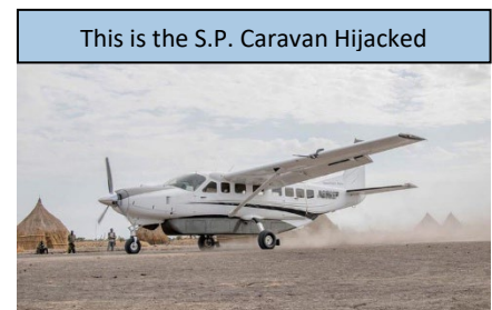
This is the S.P. Caravan Hijacked