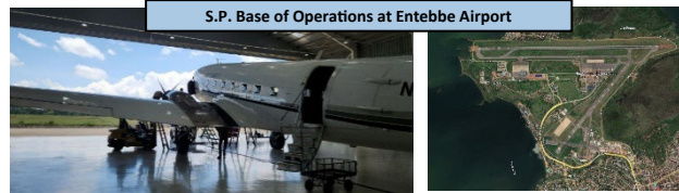
S.P. Base of Operations at Entebbe Airport