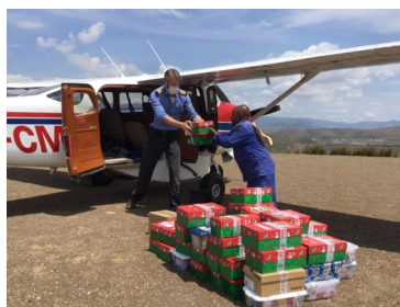
Delivering in Lesotho, Africa

At MATA we have the privilege of hearing some first-hand reports from our own people who have gone on to serve with other mission agencies that regularly partner with Operation Christmas Child in the field. These are photos of shoebox gifts that have traveled to some extremely remote and isolated locations. We're informed that for many children, these are the only gifts that they will ever receive from anyone during the entire year. You are having a profound impact on many, many children.