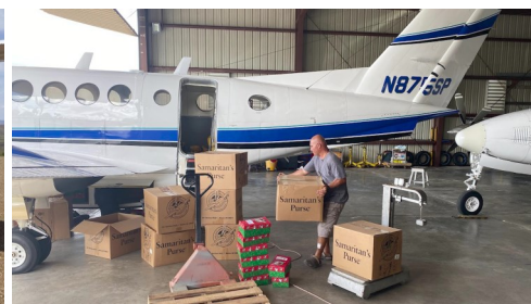
Delivering in the Islands of Micronesia