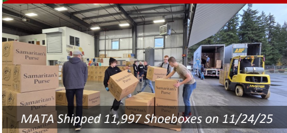
MATA Shipped 11,997 Shoeboxes on 11/24/25

This year, your partnership with our ministry has a part in distributing shoeboxes of gifts to children living in more than a hundred countries. Each shoebox represents a child who will hear the Gospel of Jesus through on-site churches and mission agencies. Children then go home and also tell their family and friends. Some children ask field workers to please go and thank the donors who sent the shoeboxes. It is our pleasure, through this letter, to forward their thanks to YOU!