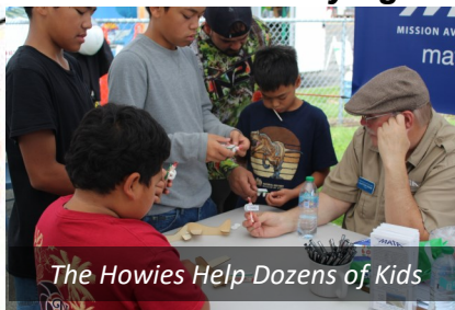
The Howies Help Dozens of Kids