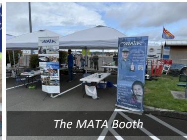
The MATA Booth

Every year we have the privilege to set up a large booth to represent Jesus and the MATA ministry at the Arlington Airport Community Day on a Sunday morning & afternoon during late August. This event attracts a large number of unchurched families from around Western Washington. More than 150 children came through our booth this year to build candy airplanes, receive free gift cards for the children's version of the Jesus Film, and have their face or hands painted by our partners from CEF (Child Evangelism Fellowship). Children are given the option to hear a Gospel message while having their faces painted. Most readily agree to listen while many unchurched parents also hear the Gospel. God gave us fruit in seeing three children pray for salvation through Jesus!