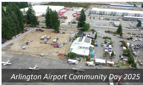
Arlington Airport Community Day 2025