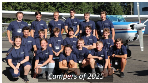
Campers of 2025

Eighteen teenagers representing nine different U.S. states attended MATA's Mission Aviation Summer Camp during the last full week in July.