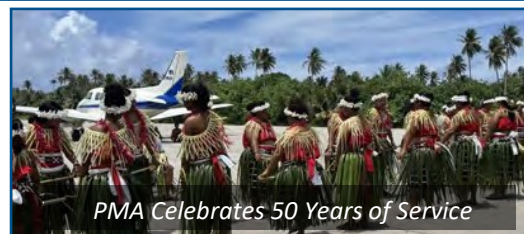
PMA Celebrates 50 Years of Service