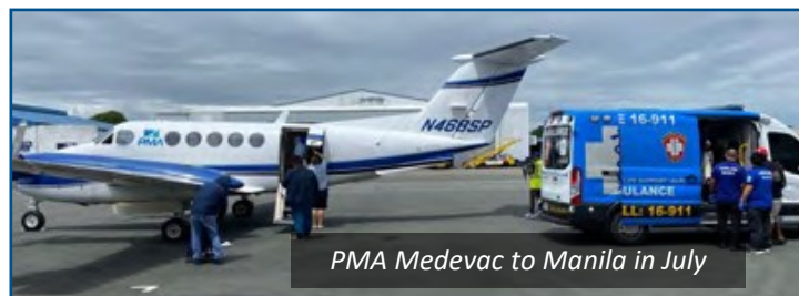
PMA Medevac to Manila in July

YOUR partnership in prayer for our ministry at MATA has been critical to help meet the desperate worldwide need for missionary pilots and mechanics. Because YOU took the time to care, more laborers for God's spiritual harvest have been and are being trained to be the hands & feet of Jesus in loving and providing for the needs of people who are hurting. Even more importantly, the Gospel is being proclaimed and saving spiritual lives, freeing them from eternal darkness and torment forever. Praise God and to Him be all the Honor and Glory!