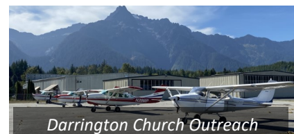
Darrington Church Outreach

Sunday, Sept. 14: MATA staff and students will be flying to a church that borders the local runway in Darrington . This event is intended to be an outreach to the local community, including those who don't normally attend church. MATA will provide short scenic flights to people at no charge following Sunday services (which will feature a MATA speaker) and a potluck. Please pray for good weather and opportunities to encourage people with the Gospel and involvement with missions.