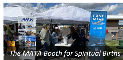
The MATA Booth for Spiritual Births