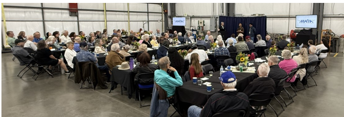
Partners Celebrating God's Provision at the MATA Academy May 3rd.