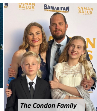
The Condon Family

https://www.youtube.com/watch?v=DE4K03Thk5M