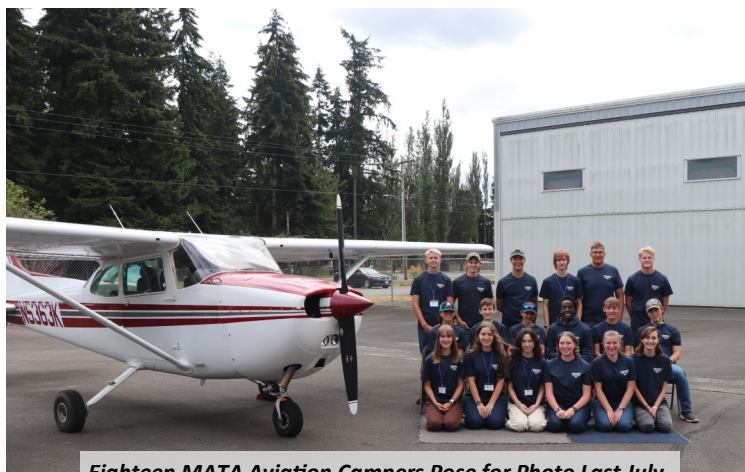
Eighteen MATA Aviation Campers Pose for Photo Last July

Every July, teenagers (ages 14 - 18) from across the United States travel to MATA for a week of intensive flight training and missions instruction to explore the realities of what is needed to become a missionary pilot. Most days start very early in the morning and stretch into the later evenings. MATA has provided this camp for many years, and many teenagers have been called by God to serve full time in missions as a result! This camp has been very popular and is frequently filled before the end of April. It is not unusual for us to get feedback on how life-changing this camp can be for participants. As of this writing, only a couple of camping positions remain open and the application process is closing soon. For more information and an application, visit our website at mata-usa.org .