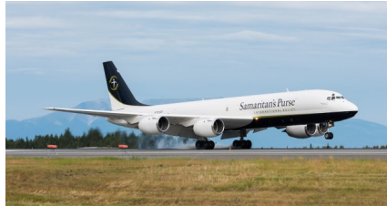
SP's Boeing 757 Cargo Plane