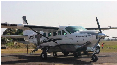
One of SP's Cessna Caravans