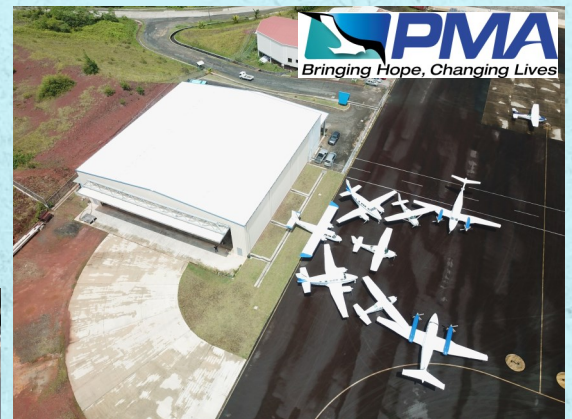
New PMA Hangar with the PMA Aircraft Fleet

President Whipps of Palau (lower left photo, standing on right) joined the PMA team and other government dignitaries to celebrate the Grand Opening of a new hangar for Pacific Mission Aviation (PMA). Ambassadors from the United States, Japan, and Australia were also part of the event which included prayer and a ribbon cutting. For the first time ever, the entire PMA fleet (photo on right) was at one location. PMA serves the nations of Micronesia, Palau, and the Philippines, proclaiming the Gospel, flying medical evacuations & sea searches, and doing ministry for outlying and isolated islands. MATA currently has four alumni pilots who are working full time to help PMA with operations (see below photos).